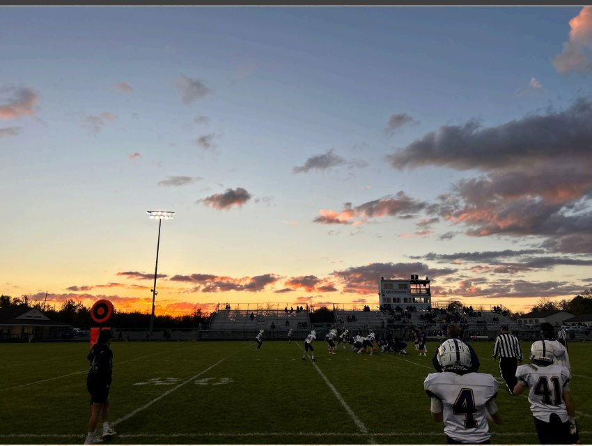
Cheerleader Ava Arble (29) took the photo above at the eighth grade football game at Onsted.