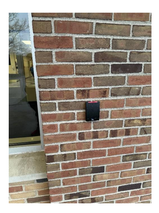
Middle School New Doorbell Location