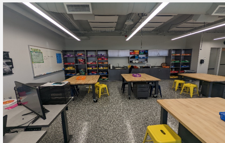
Phase 1 Addition: STEM Room