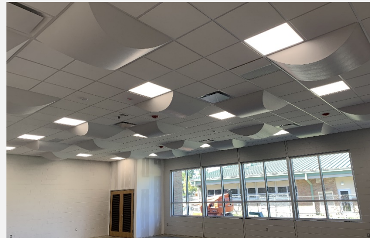
Phase 1 Addition: Band Room