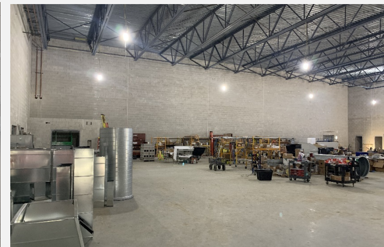
Phase 2 Addition: Multi-Purpose Gym