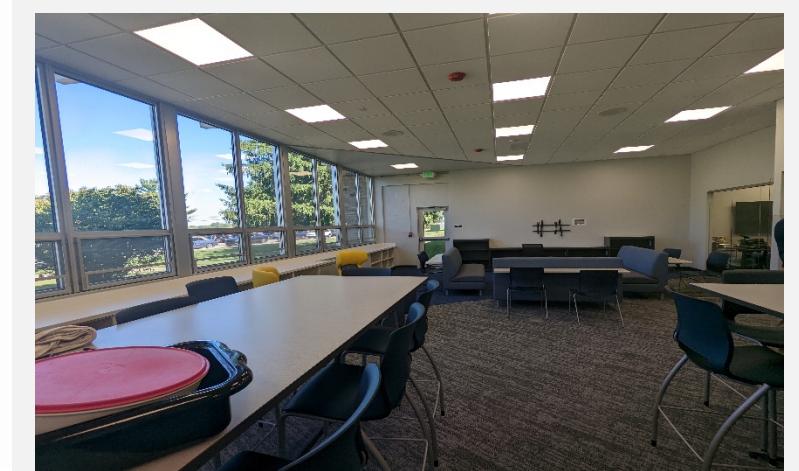
MS/HS Media Center