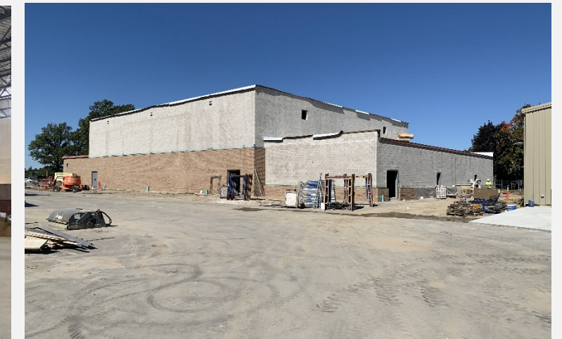
Phase 2 Addition: Multi-Purpose Gym & Locker Room