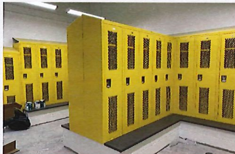
Varsity Locker Room