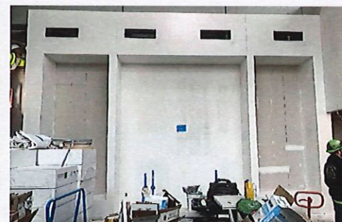
Multi-Purpose Gym Entry