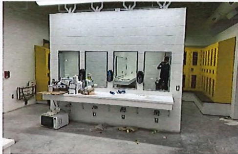
Varsity Locker Room